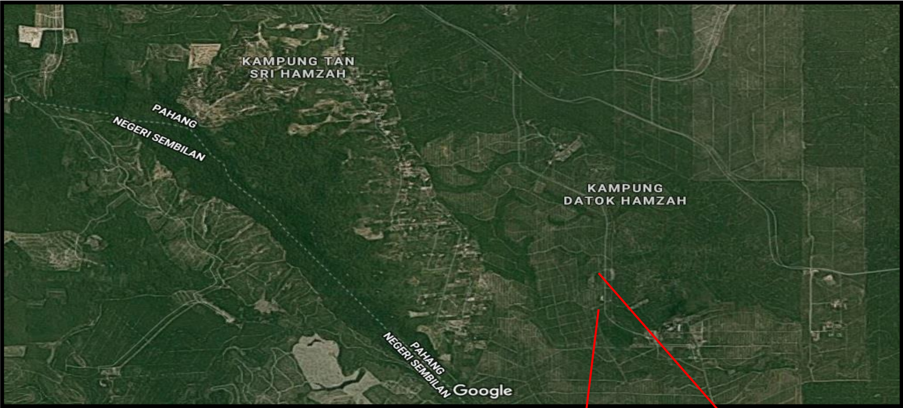
Location Map of Bukit Senorang MU