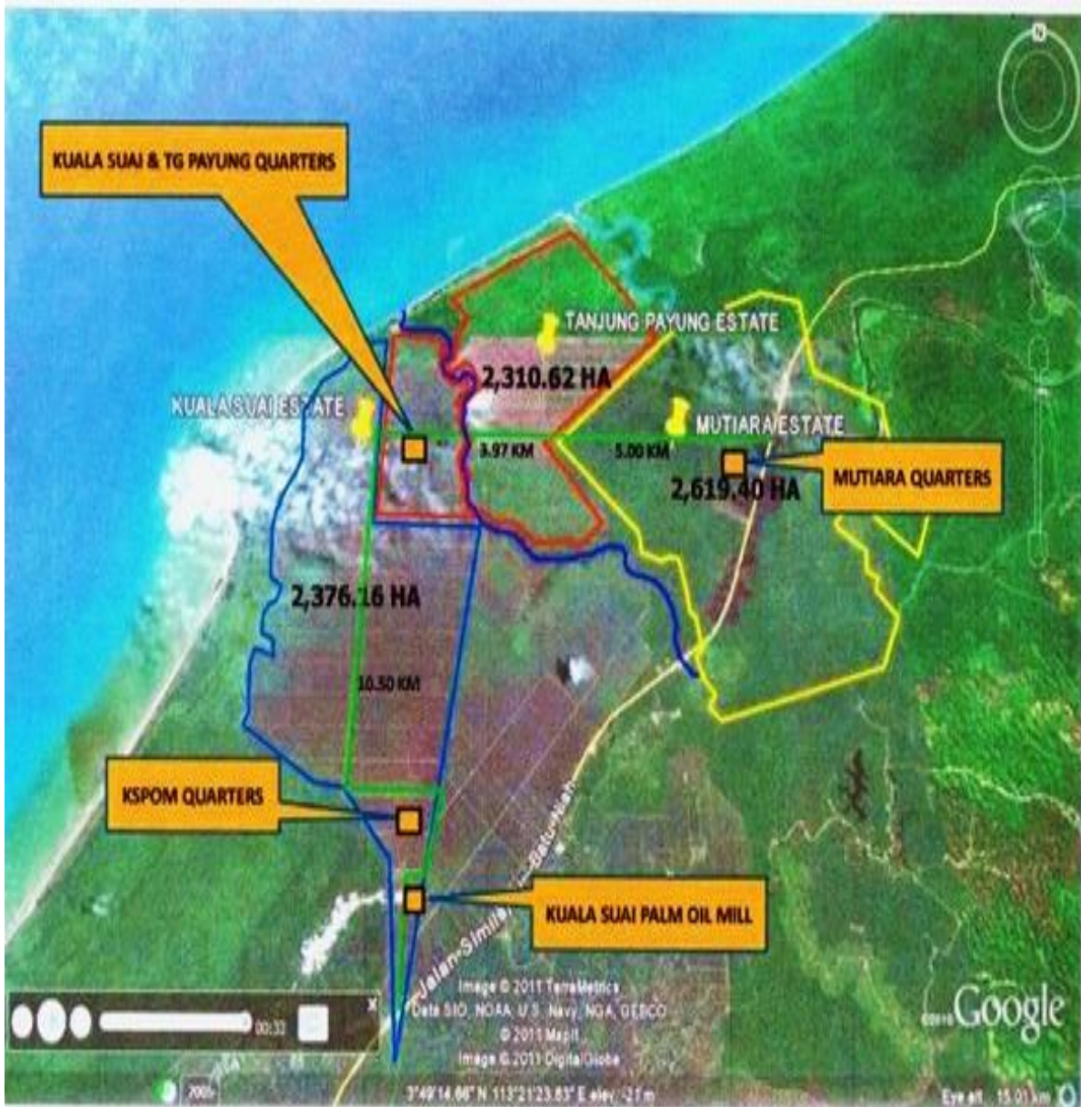
Map of Arah Bersama Plantation Certification Unit