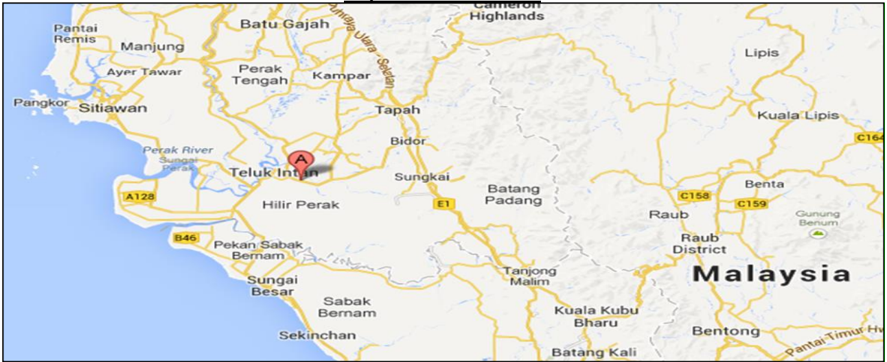
Map of SOU 5A Selaba